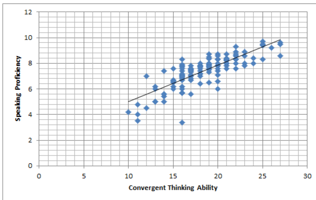
Figure 1. Relationship between speaking proficiency and convergent thinking ability

The Pearson correlation parametric statistic is used to understand the relationship between convergent thinking ability and English speaking proficiency and the result is perceived as linear because the graph shows a value of R^2=0.816 which indicates that 81.6% of the speaking proficiency score is directly contributed by the convergent thinking ability score of students.