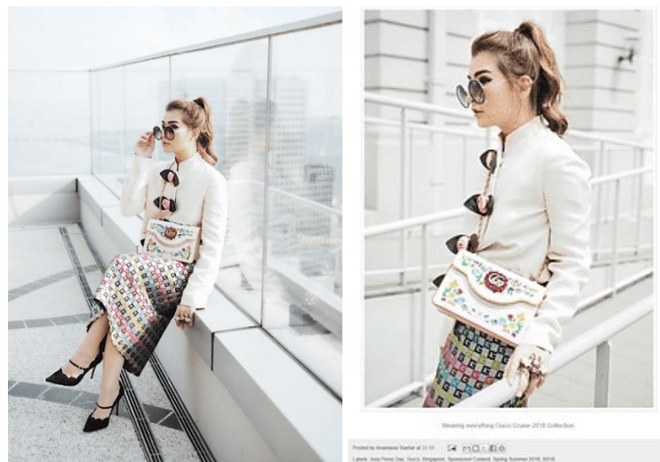
Figure 6. Seasonal Fashion on Brown Platform

In Indonesia, the temperature difference in the trans-seasonal weather, from rainy to dry, or vice versa, is not glaringly contrast. Indonesians thus do not need a whole wardrobe change every season. However, the trans-seasonal collections can be seen in Indonesian fashion blogipelago. One of them is Siantar, clad in Gucci Cruise 2018 collection (see Figure 6). Ineptly, her OOTD is not photographed in line with the reason why the collection was created (i.e., sailing on a cruise or 'staycationing' in a resort. This fact indicates that the collection is not served by Indonesian fashion blogger for its functionality, but rather for its sign-exchange value.