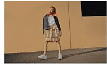
One-piece Flannel Check & Long Sleeve Shirt worn as shirt, Custom Jacket, and Full Length Skirt

The unwritten requirement for an essential outfit is that it needs certain balance to achieve an effortless look without looking “lack of effort”. Rather than pairing my flannel shirt with a boring & predictable denim pants, I switched it up to white pants as a brighter and fresher choice. A simple turtleneck also works as an accent, lifting the whole outfit one level from being basic.