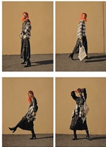
One-piece Flannel/Checked Long Sleeve Shirt & Custom Made Dress

TUESDAY – “I Don’t Know What I Want But I’m Always Prepared For Anything”