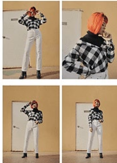
One-piece Flannel Check Shirt & High Waist Straight Ankle

I am too creature of habit. I have no routine and need to improvise and schedule my errands daily. Combination of plaid flannel shirt, a fancy satin dress, grocery bag, and latex boots screams: “Am I going to the mall? Or just to supermarket to grab groceries? Is this actually just a fancy looking pajama? No one knows! Even I don’t know!”