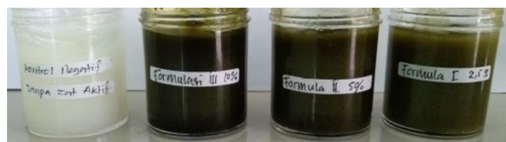
Figure 1. The Results of the Formulation of 96% Ethanol Extract Noni Leaf Ointment

This ointment was made with two fat bases: adeps lanae and vaseline album, both of which can be melted without previously melting the base. The ointment was made by weighing all of the ingredients according to the design formula. Then, the ethanol extract of noni leaves was put into a heated mortar. First, propylene glycol was gradually added while crushing until the mixture was homogeneous and smooth. Then, the process was repeated with the addition of adeps lanae, methylparaben, and vaseline album sequentially and alternately one by one to create a homogeneous and soft ointment. Furthermore, the ointment was placed in a container labeled according to its concentration. The design formula is shown in the Table 1.