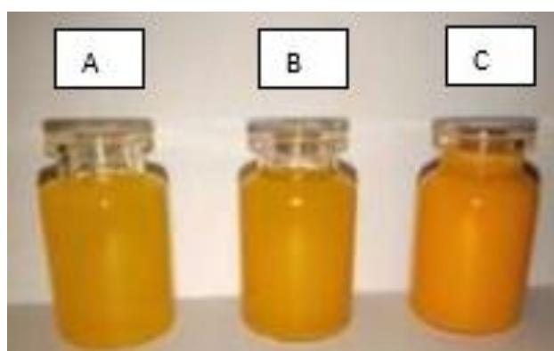
Figure 1. Organoleptic evaluation of curcumin TE gel F1 with TE curcumin 0,5% (A), curcumin TE gel F2 with TE curcumin 2% (B), curcumin TE gel F3 with TE curcumin 8% (C).

injected intraplantar was calculated to test the anti-inflammatory activity of curcumin TE gel. The inflammation caused by carrageenan is acute and does not cause tissue damage. A mercury plethysmometer was used to determine edema volume (Dwita et al. , 2019). Table 3 shows that the largest average volume of edema is negative control, positive control, curcumin TE gel F1, curcumin TE gel F2, curcumin TE gel F3. TE contained 10 mg (F1), 40 mg (F2), and 160 mg (160 mg) of curcumin. The curcumin content of TE ranges from 10 to 160 mg because the curcumin nanoparticle compositions delivered through the epidermis contain anti-inflammatory substances in the range of 10 to 40 mg. Formula 3 is applied as the highest active testing dosage (El-Mahdy et al. , 2020; Gonçalves et al. , 2017).