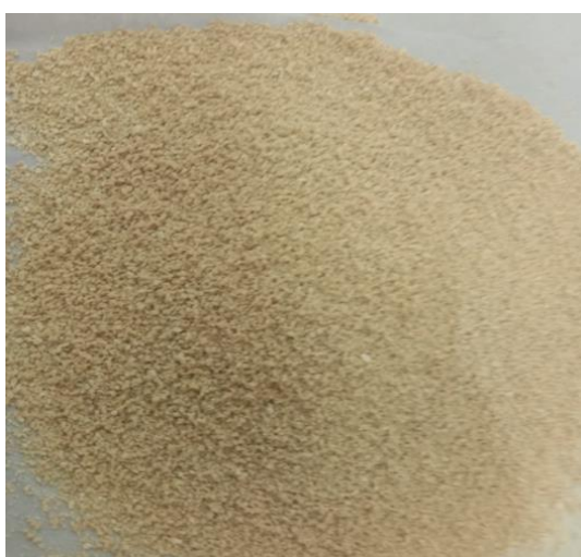
Figure 1. Effervescent granule formula 4.

We continued to change the ingredients and made formulas 2 and 3 which could ultimately produce effervescent granules. However, it was constrained by the calculation of flow time, angle of repose and tap index. Formula 3 could not meet the standards and could not be assessed; even after 45 minutes, the formula 3 showed a humid physical condition, based on the evaluation results of effervescent granule preparations.