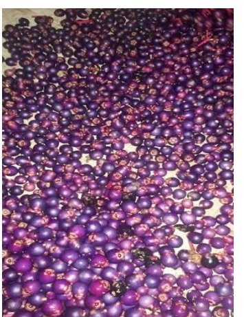
Figure 1. Parijoto fruit

Parijoto is a shrub (1-2 meters high) typical of the Muria Mountains, Kudus. The fruit is similar to kersen, purplish red, rounded, and has a distinctive hemispherical section attached to the petals, 5-8 mm in diameter. The seeds are round, larges, mall, and white (Figure 1).