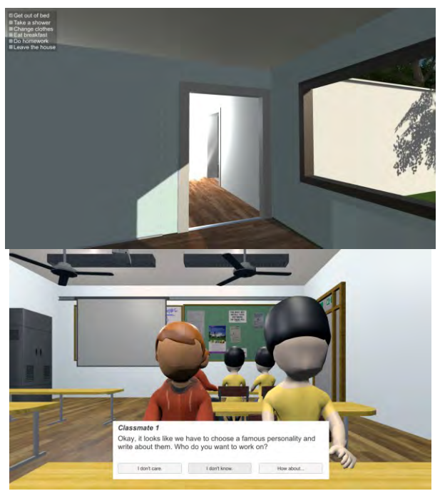
Figure 1. Screenshot of the Gameplay of in Someone Else's Shoes

The second level, on the other hand, focused on impairments in communication and socialization that the protagonist encounters while completing a group activity in school. Unlike the first level, this level will not involve the protagonist moving within the environment. Rather, this level will be text- and dialogue- heavy. Every time an NPC requires a response, 1 or 3 replies will appear on screen, which the player will have to choose amongst as a response to the NPC.