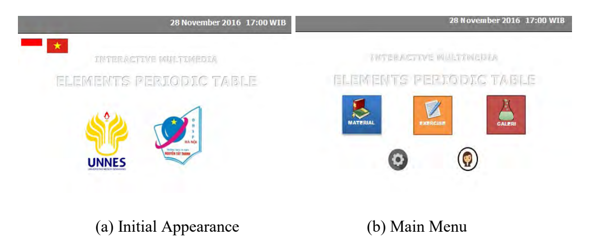
Figure 1. Design of Elements Periodic Table Interactive Multimedia

Elements periodic table interactive multimedia is divided in to some parts: (1) initial appearance (Universitas Negeri Semarang and Nguyen Tat Thanh High School logo, (2) main menus (material menu, gallery menu and exercise menu), (3) sub menus, and (4) additional menu (developer profile). Main menu buttons have different shape and size with additional buttons to indicate the different of focus point between them.