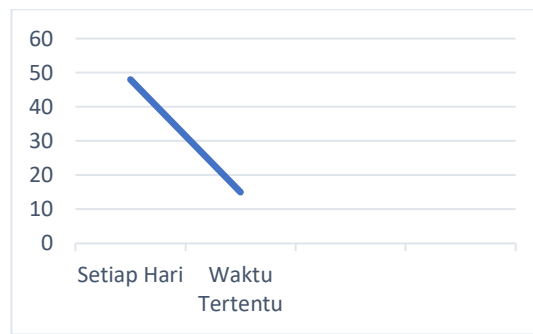
Figure 1. Time of using digital Quran

The data in Figure 1 presents the findings of research conducted by students of UPTQ (Qur'an Memorization Development Unit) on the significant assistance provided by digital Qur'an applications in memorizing the Qur'an. The field results regarding the time spent using digital Qur'an applications varied among the students.