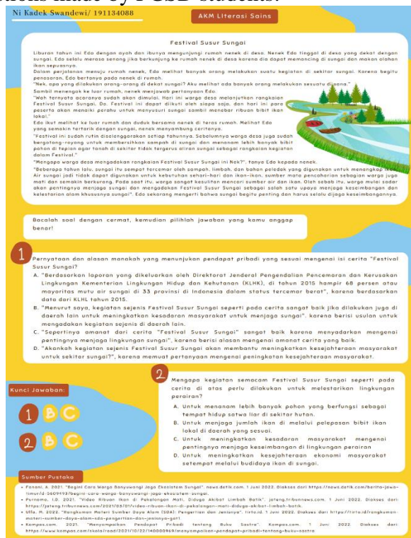
Figure 1. First infographic: Festival Susur Sungai (River Festival)