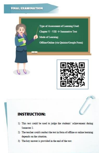
Figure 2. Example of AoL