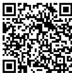
Figure 3. Barcode of the final product

The researcher chose self-assessment as well as peer assessment as a type of assessment of learning used, in which assessment as learning includes the students dynamically in the assessment process (Lam, 2018). Besides, self-assessment allows the students to observe their learning, achievement, and progress (Mutch, 2012). Further, peer assessment could assist the students to monitor their learning from the perspective of their peers in the form of feedback. Dann (2014) added that the feedback given in the assessment as learning could support the students' learning. The other students, as a peer, could give feedback on assessment as learning. The feedback from a peer could ease the students to monitor their learning since it is given by the same age.