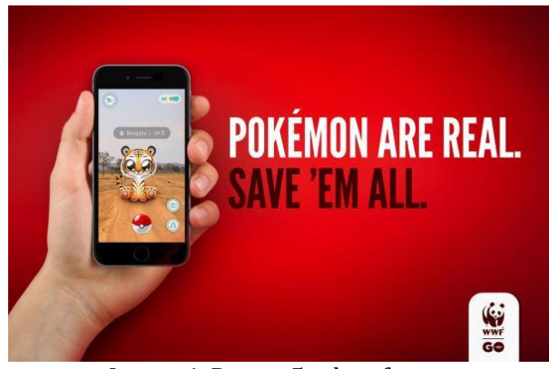
Image 4. Poster 5

This poster was released in 2016 in France by WWF. There is a hand holding a smartphone with an image of the Bengalix character in Pokémon Go! Along with writing, ' Pokémon are real. Save 'em all. '