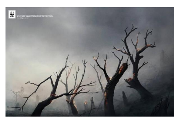
Image 2. Poster 2

The following poster 2, released in 2017, was published in Indonesia and was created by WWF. It shows the forest's burned condition, leaving only charred trees. The burning forest took many victims, including the life of the tiger.