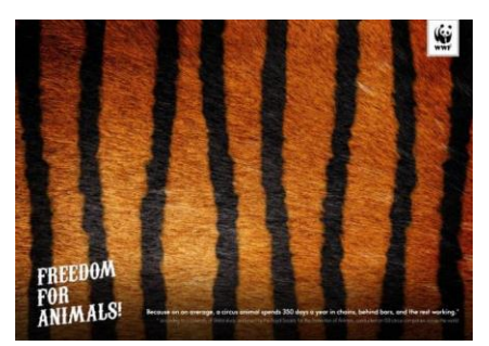
Image 3. Poster 3

This poster was released in 2017, published in Romania, and created by WWF. In this horizontal poster, the tiger's stripes fill all over the poster, accompanied by WWF's logo and some linguistic elements.