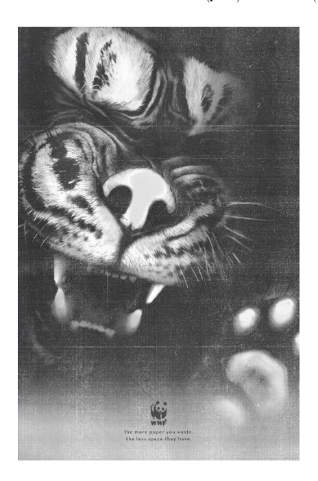
Image 1. Poster 1

From the perspective of compositional meaning, the informational value of the following poster 1 is ideal-real (Top to Bottom). The ideal part is the appearance of a tiger (Top) with something pressing against it. In real life, the figure is typically photocopier output. Meanwhile, the sentence below the tiger that invites people to save paper is the real part (Bottom). Tigers live in the forest; paper comes from trees. So that if humans waste the use of paper, some people will cut down more and more trees in the woods. It is not that people should stop using paper; people must also consider the condition of the origins of paper because many living things need trees.