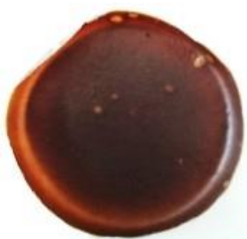
Figure 1. Results of physical appearance of optimum formula antihypertensive herbal patch

The equation obtained from the quercetin calibration curve in methanol was y = 0.0543x - 0.0178 with a correlation coefficient (r) of 0.9999. The equation was used to determine total flavonoid levels in extracts and patches. Total flavonoid level in viscous extract was 0.235 \pm 0.002\% (w/w). The colour of patch preparation produced was dark brown because the colour of water extract was black. Patch has circular shape because it was printed on a Petri disk (Figure 1). Patches were relatively flexible due to the presence of PEG 400 as a plasticizer which could increase patch elasticity (Nurahmanto et al. , 2017). The optimal patch formula had the best physical properties test value. Optimal formula with HPMC: CMC Na ratio of 220: 180 mg would produce a response value approaching the target value of 98.2%. Results of physical properties of optimum formula antihypertensive herbs patch compared with a research by Nurahmanto et al. (2017) were presented in Table 2.