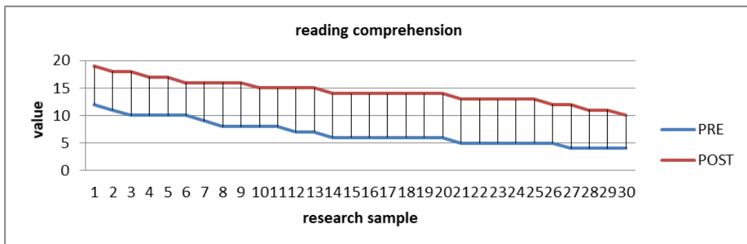
Graph 1.1 The development of reading scores for the understanding of School counselors in East Jakarta vocational

Based on the data obtained before and after being provided with classical guidance services using the window shopping method, it is seen that the reading comprehension of the vocational school counselors is developing. The details can be seen in the following graph