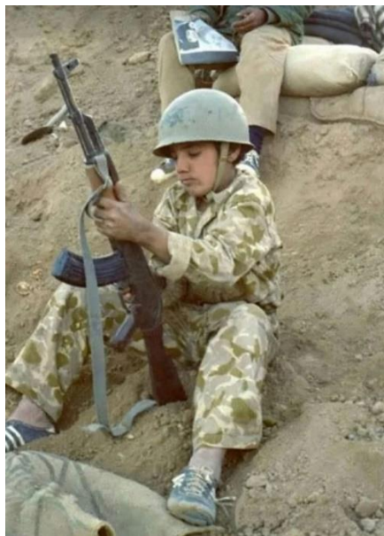
Figure 5. An Iranian child soldier in the Iran-Iraq war ( https://i.redd.it/xuvru5kl8wm61.jpg )

Jangal ). This uprising started in 1914 and remained active against internal and foreign enemies until 1921 when the movement was completely abandoned after the demise of Mirza Kuchak Khan (Matin-Asgari, 2009). The number 313, however, refers to a Shia myth which holds that there will be only 313 true Muslims in existence before the arrival of Mahdi. These 313 will form Mahdi's army in the fight against injustice. Embedded in the aforementioned lines, therefore, lies a strong association of the reciters with Twelver Shia fundamentalism while highlighting their fighting spirit against opponents of the Islamic regime. Alongside these ideologies are powerful the reciters' determination to make sacrifice at highest level which typically reminds us of enlistment of child soldiers during Iran-Iraq war and the ways these young people were brainwashed to give up their lives to keep Islamic regime alive (Figure 5).