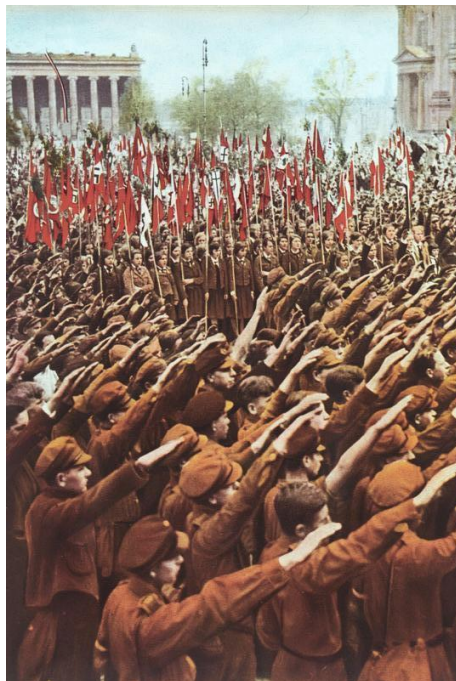
Figure 4. Members of the Hitler Youth in Berlin performing the Nazi salute at a rally in 1933 ( https://upload.wikimedia.org/wikipedia/commons/0/03/Bundesarchiv_Bild_147-0510%2C_Berlin%2C_Lustgarten%2C_Kundgebung_der_HJ.jpg )

Although this is not an identical gesture to what was known as Nazi salute (or Fascist salute) in which the right arm was fully extended, facing forward, with palm down (Figure 4), yet, what we should pay attention to is the essence of the act itself and the age of the performers. This means that when an act of military salute, regardless of its form, is performed by a group of children in a strictly organised manner, the real meaning of such event transcends the mere idea of war or defence; it becomes a political gesture that is unique to dictatorial regimes.