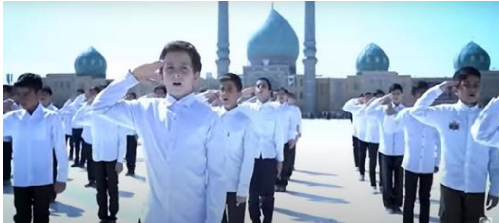
Figure 3. Young boys in original video of Hail Commander anthem

automatically sets them apart from other women who wear mantua, at least superficially.