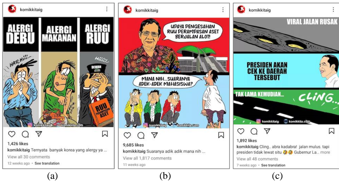
Figure 2. Challenges to power structures of political cartoons on Instagram posts

Meanwhile, in the political cartoon posted in June 2023 ( see Figure 2. c), there is a challenge to the policies and corrupt attitudes of state officials. The cartoon shows a part of the illustration about a damaged road that has become national news in a province. The damage is in the public spotlight because it has occurred for years without any repair efforts from the governor and his staff. Another part of the illustration is a smiling figure of President Jokowi with the caption that he will visit the area. Meanwhile, the last part of the illustration is a picture of a road that looks smooth because it has been repaired in a short time. The cartoonist of the post wants to challenge illogical provincial government policies. The irregularity is a strong indication that there is a budget game for handling the damaged road. Visually and textually, the cartoon satirizes provincial officials for their manipulative and corrupt policies.